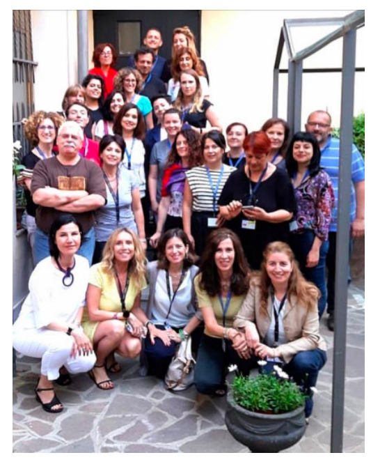
Course participants, Midas Hotel, Rome, 19 June 2019

Competence development is a key pillar of the Euroguidance strategy in Italy. EG Team successfully tested an innovative training package for mobility advisors which will be scaled up in 2020.