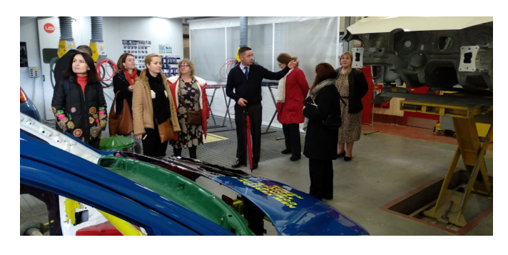
More information and all presentations can be accessed at https://euroguidance.ie/study-visit-2019

An Adult Education Guidance Counsellor described the Guidance Counselling services delivered to the Irish Syrian Refugee Programme and gave a case study on the challenges faced by refugees and the support of the AEGS service.