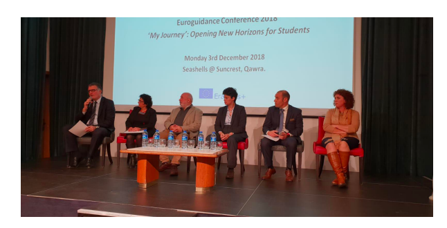
Euroguidance conference: My Journey – Opening New Horizons for Students – 3rd December 2018.

Strengthening the skills and competences of the career guidance practitioners working in the education sector in Malta is a major task of the National School Support Services (NSSS), Ministry for Education and Employment. NSSS organises regular training for 200 guidance practitioners working in our state schools and colleges, namely guidance teachers (who teach a subject but also have guidance duties), career advisors and career guidance teachers who work full time on career guidance. Training revolves around initiatives which inform practitioners about labour market opportunities, employability skills and training routes. During 2018-19 practitioners were exposed to training in the following sectors: Aviation, ICT, Manufacturing, Financial Services, Heritage, Life Sciences and Tourism amongst others.