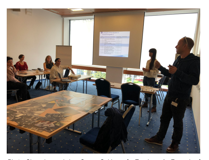
Photo: Slovenian workshop Career Guidance for Teachers: An Example of Short Training programme by Miha Lovšin PhD and Lea Avguštin)

Due to the current fast technological developments, guidance counsellors are facing questions about the changing nature of careers/occupations and the (future) skills needed in the labour market. Guidance practitioners in all cross-border participating countries face these challenges and will use the new knowledge when working with clients.